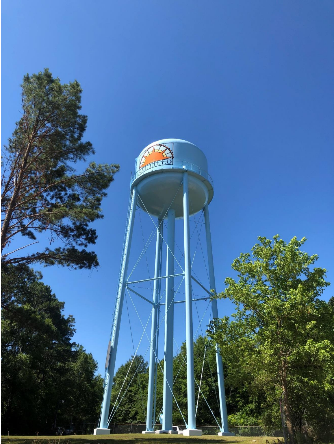
Image 22. Hwy. 145 elevated tank.