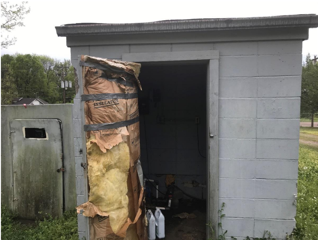
Image 4. Open door to the electrical/booster pump building at Water Street.