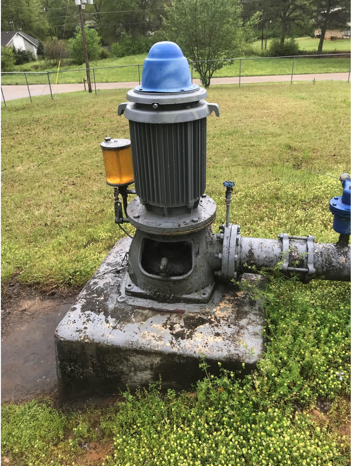
Image 2. The well at the Water Street Plant Site.