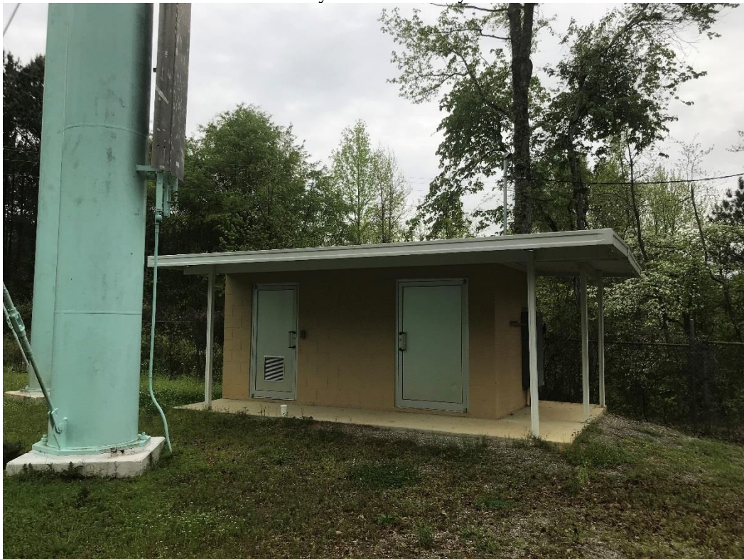
Image 11. Ground view of the electrical, chlorinator, and booster building at Turner Industrial Park Well #04.