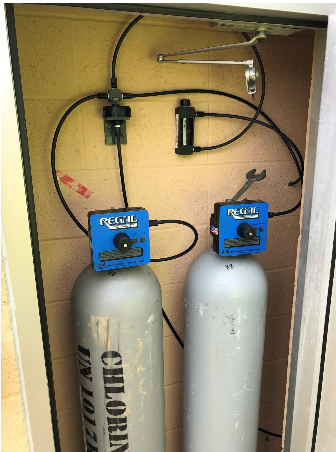
Image 16. Chlorine building and redundant chlorinator switchover at Turner Industrial Park Well #05.