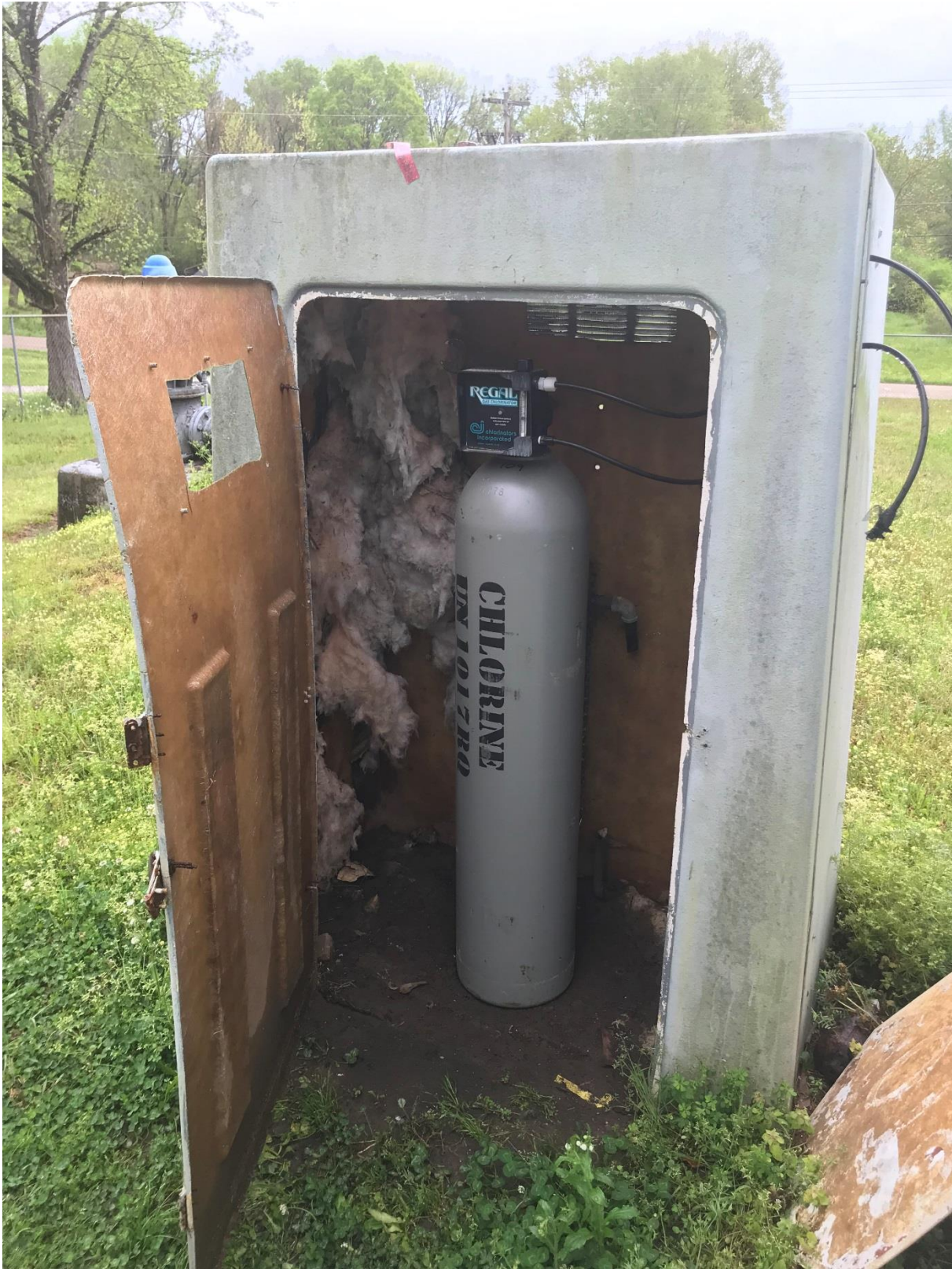
Image 5. Open door to the chlorinator building at the Water Street Plant Site.