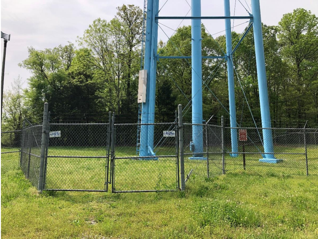
Image 10. Ground view of the security fence at Hwy. 45 West.