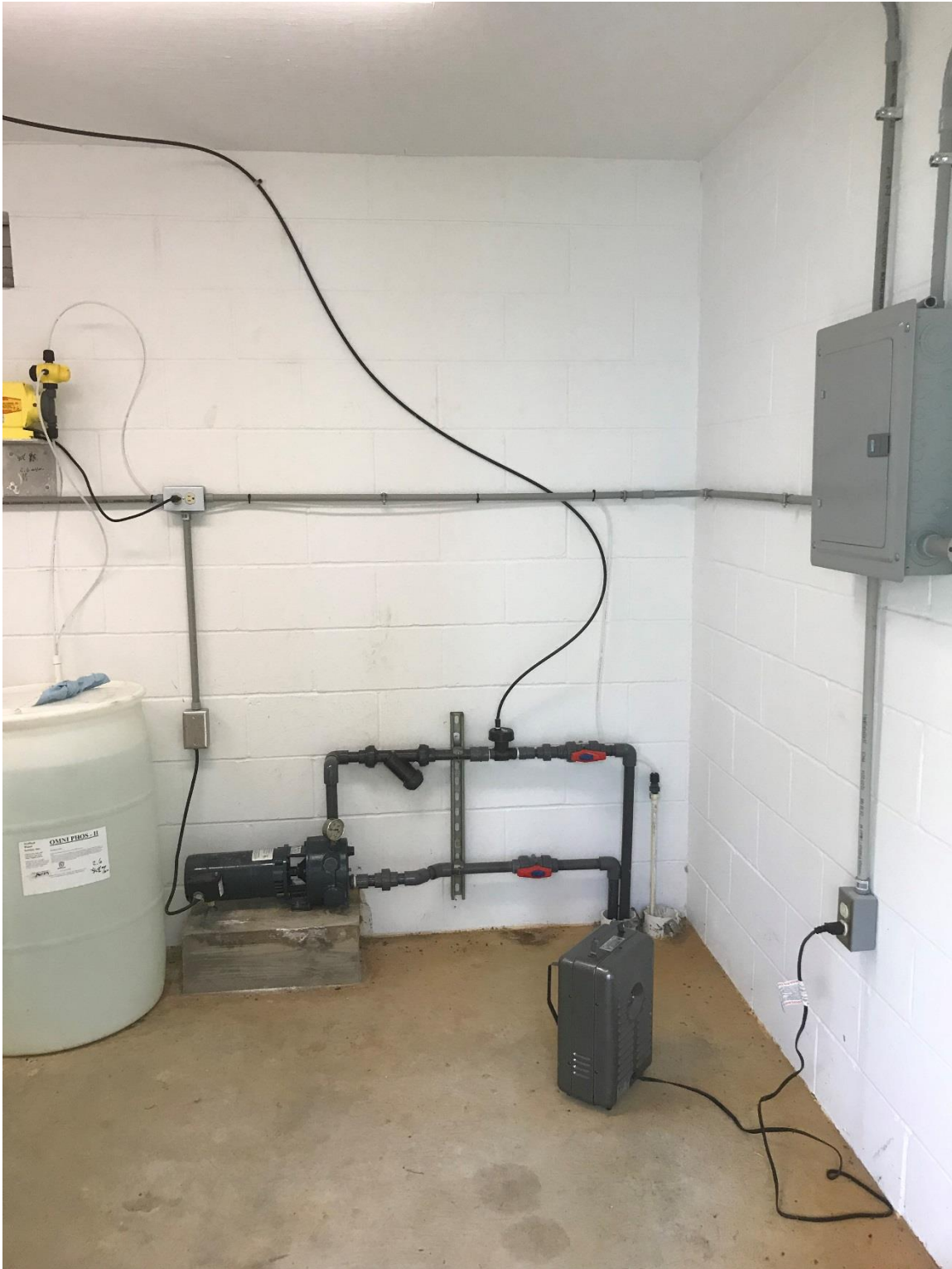
Image 15. Electrical and booster pump building at Turner Industrial Park Well #04.