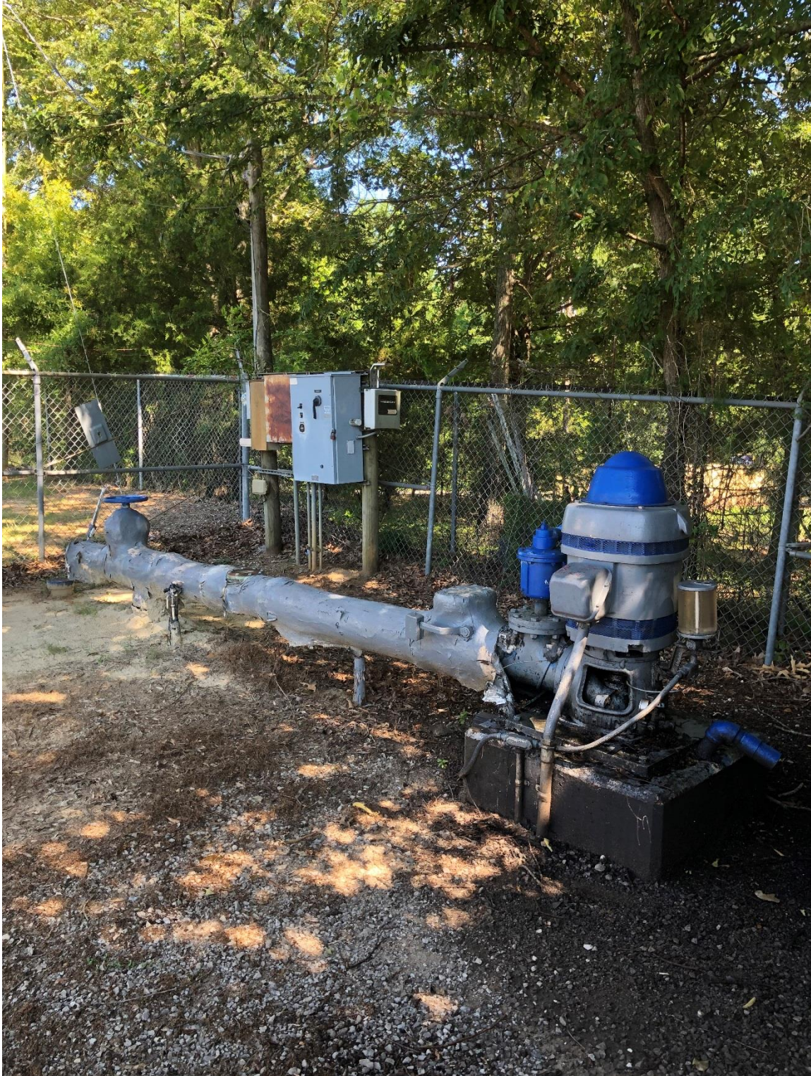
Image 20. View of the well and electrical panel at the City Park Plant Site.