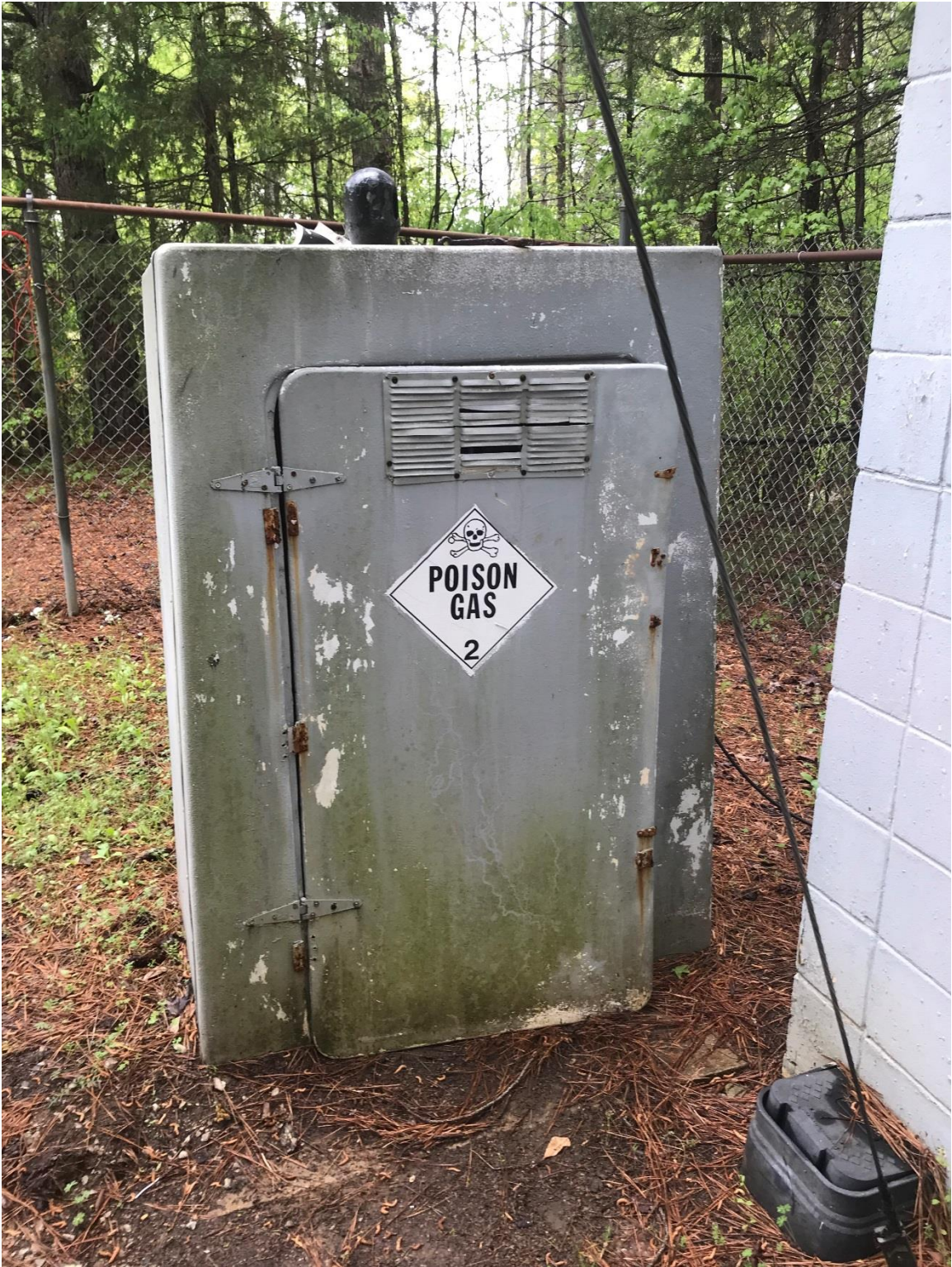
Image 8. The chlorine building at the Jeanette Street Plant Site.