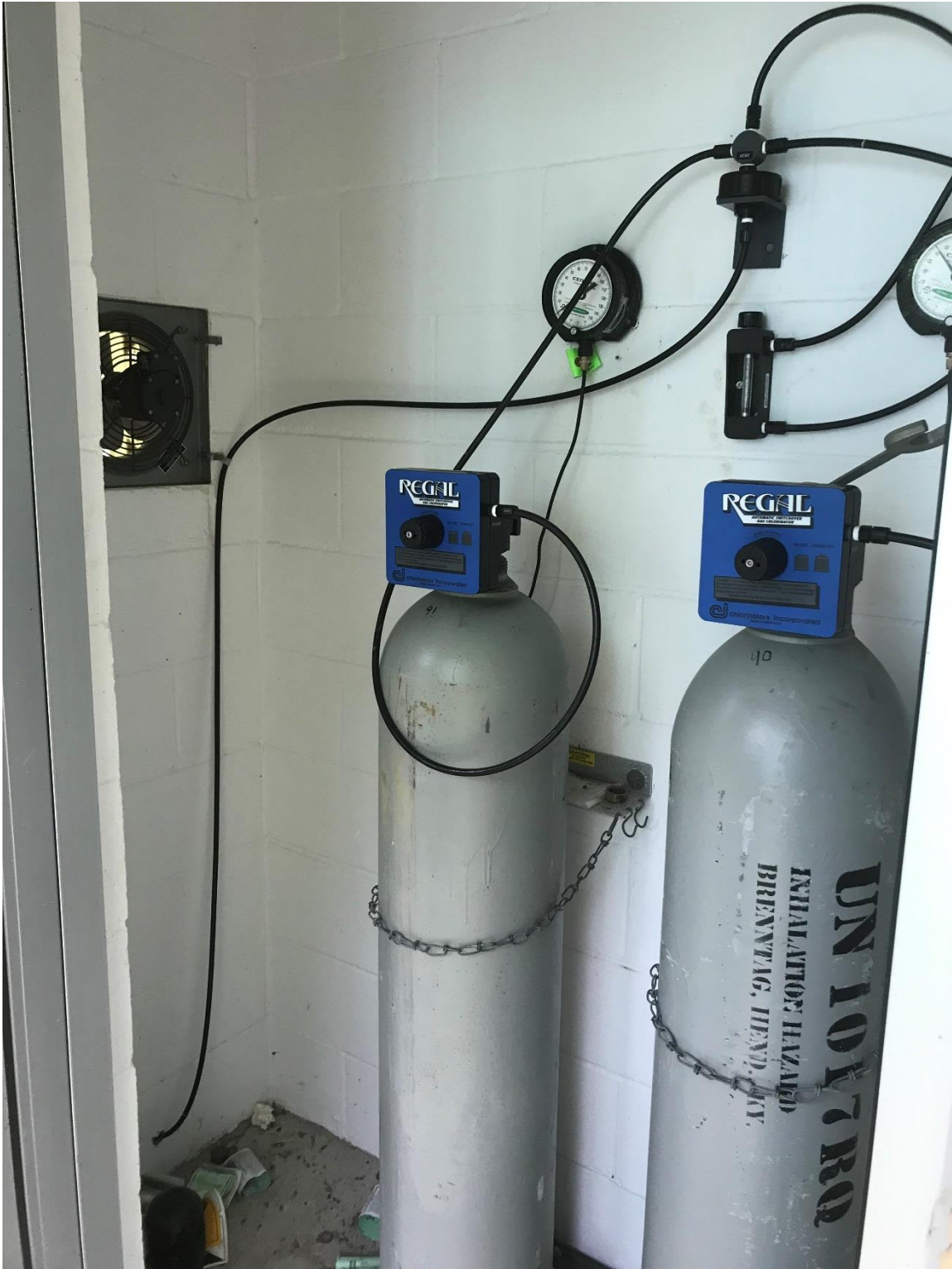
Image 14. Redundant chlorination and building at Turner Industrial Park Well #04.