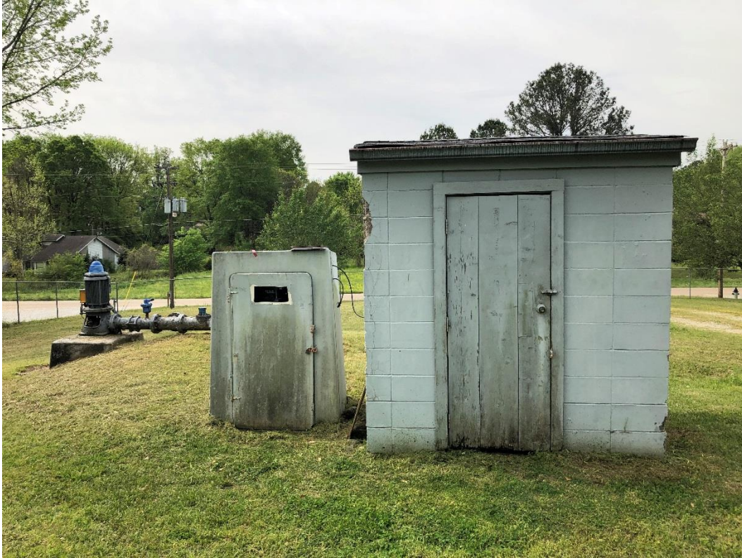
Image 3. The chlorine building and the electrical/booster pump building at Water Street.