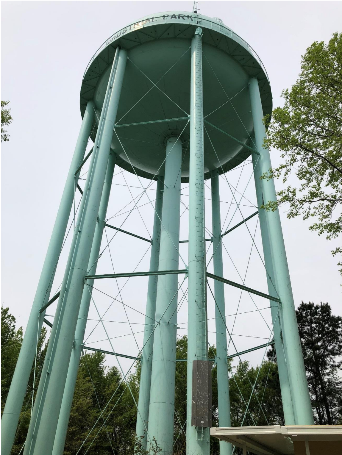
Image 12. Elevated storage tank at Turner Industrial Park Well #04.