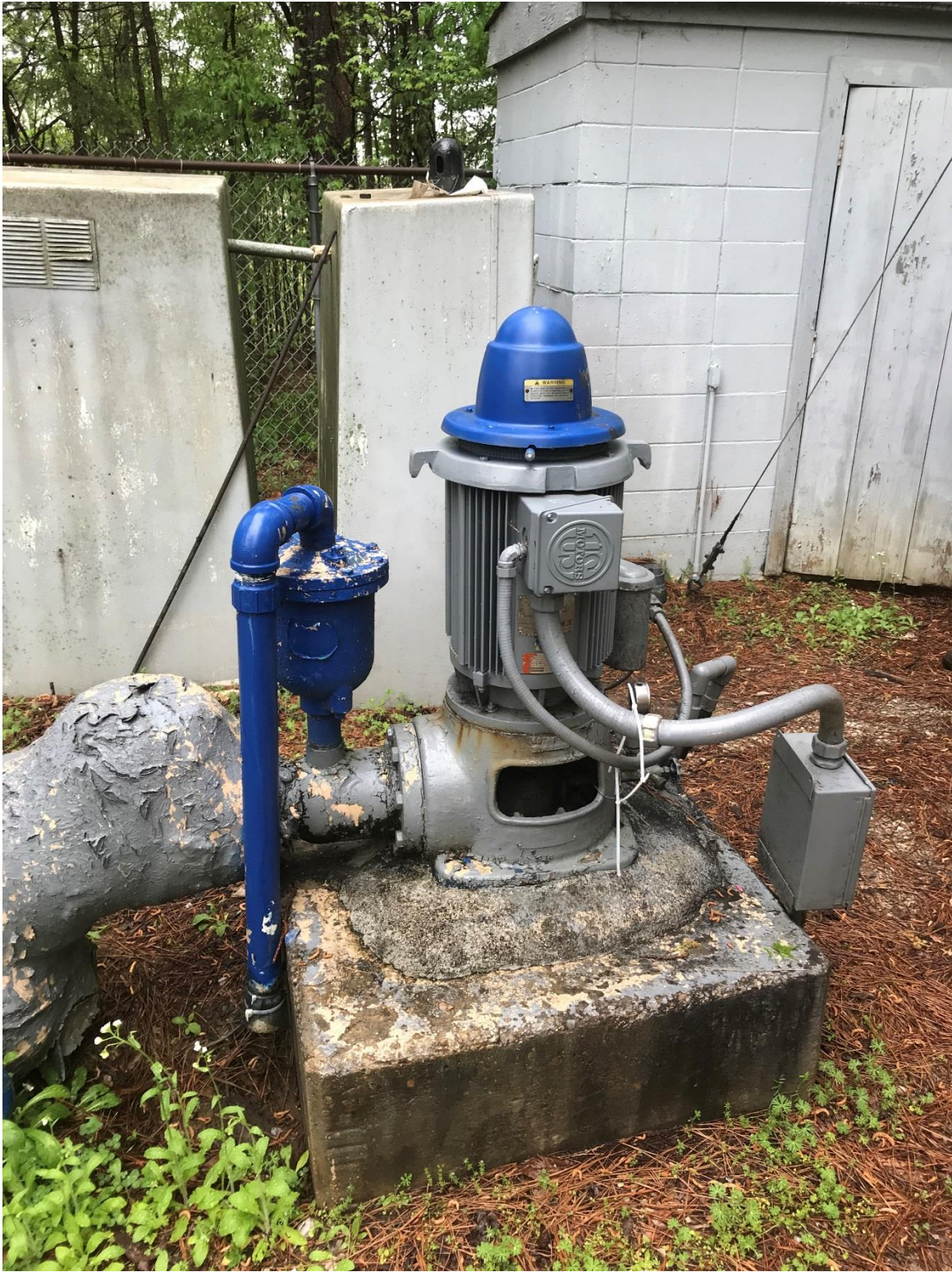
Image 6. The well at the Jeanette Street Plant Site.