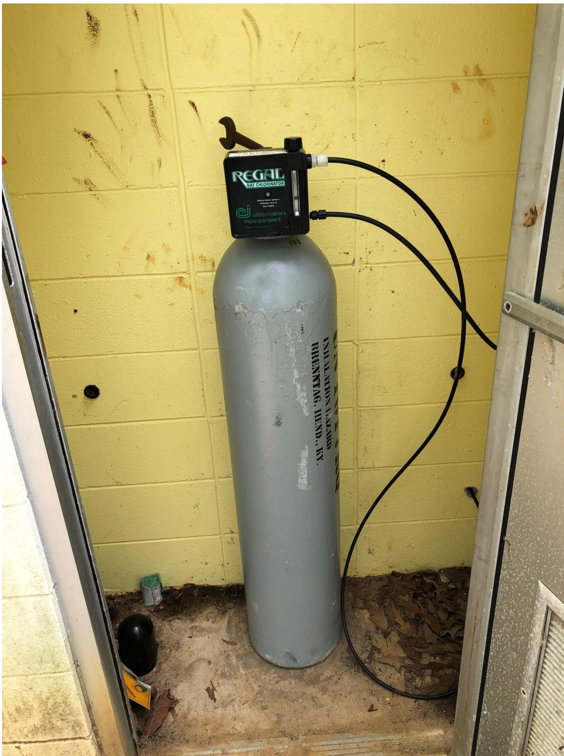
Image 21. Chlorine cylinder and single train of treatment at the City Park Plant Site.