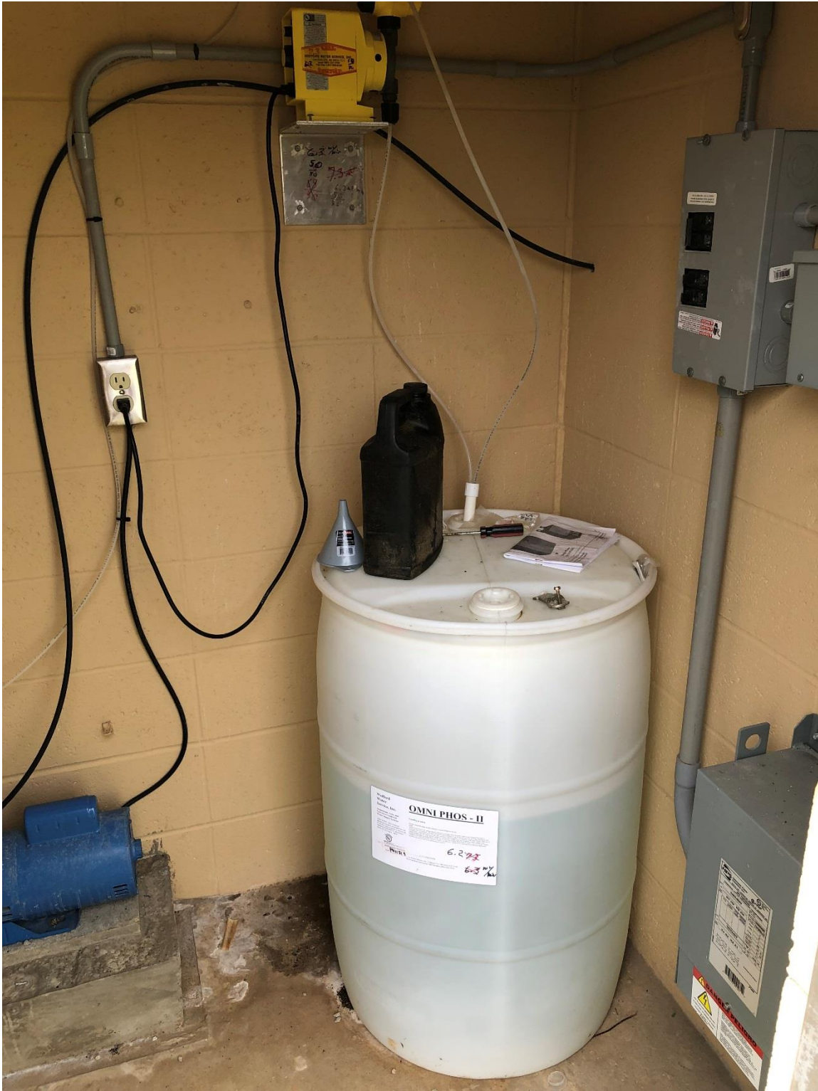
Image 18. Electrical and phosphate room at Turner Industrial Park Well #05.