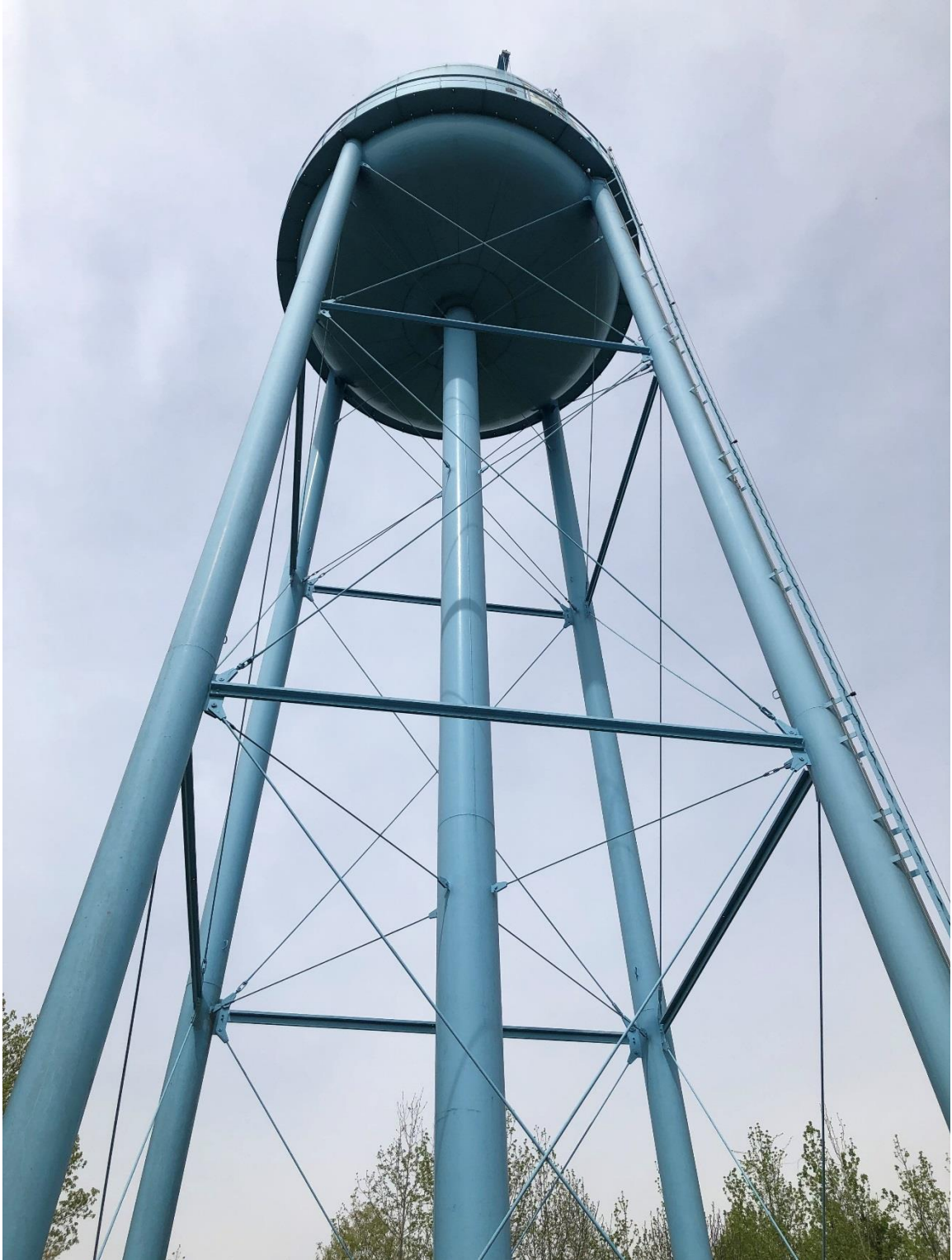
Image 9. Bottom view of the elevated tank at Hwy. 45 West.