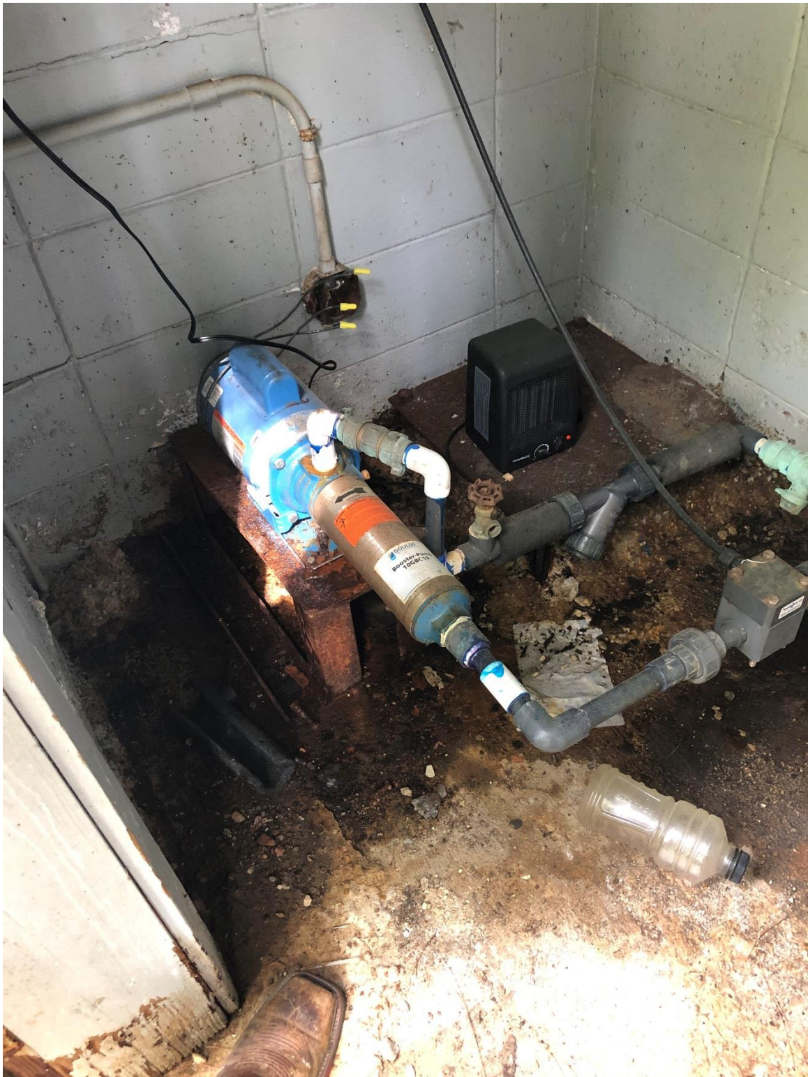
Image 7. The booster pump and electrical building at the Jeanette Street Plant Site.