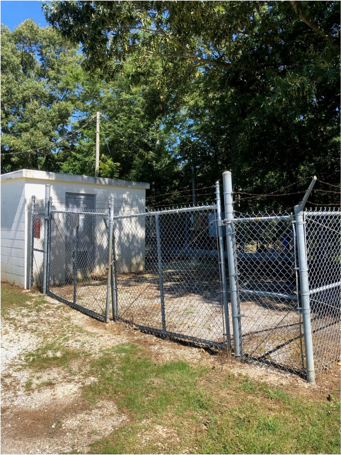
Image 19. Street view of the City Park Plant Site.