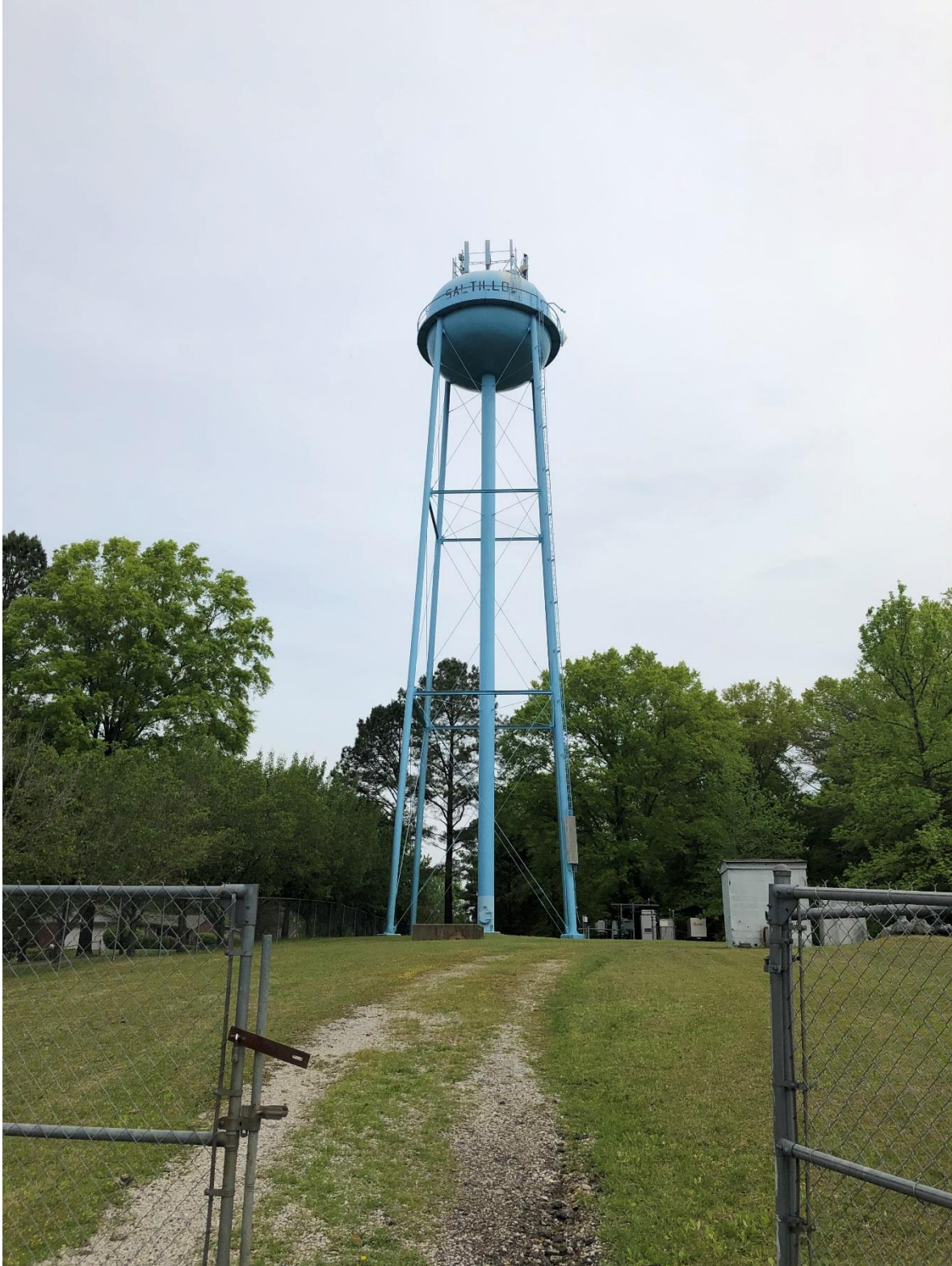
Image 1. The elevated tank at the Water Street Plant Site.